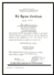
FAA PART 145 RXWY824X