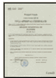
Transport Canada (808-43)