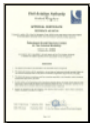
EASA PART 145 UK.145.00819